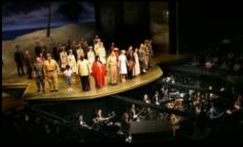
Theatres & Musicals