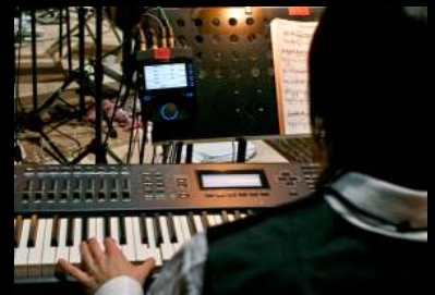
Music Schools & Home