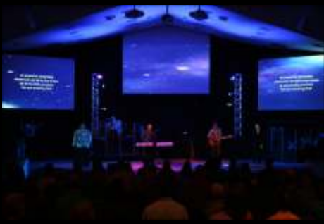
House of Worship