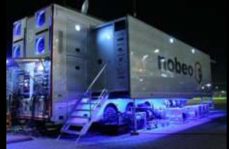
Broadcast & Press Conferences