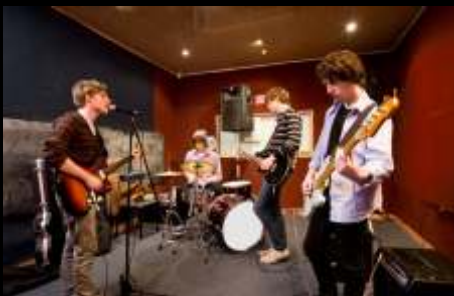
Rehearsal Rooms & Studios