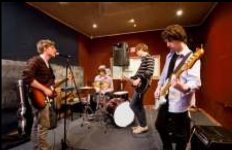
Rehearsal Rooms & Studios