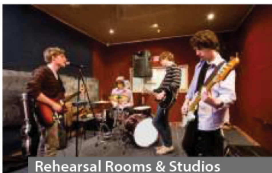
Rehearsal Rooms & Studios

myMix CONTROL, the web browser based software, completes the system by offering the engineer the capability to back up a whole system, configure and edit individual units, or lock specific functions through any device that accesses the network wired or wireless.