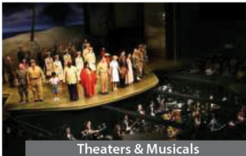
Theaters & Musicals