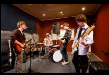
Rehearsal Rooms & Studios