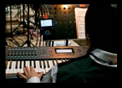
Music Schools & Home