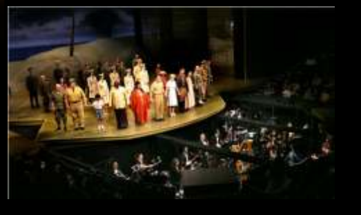
Theatres & Musicals