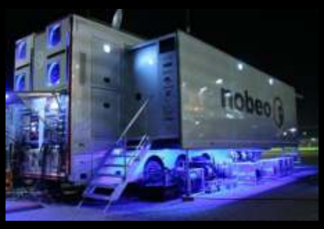
Broadcast & Press Conferences