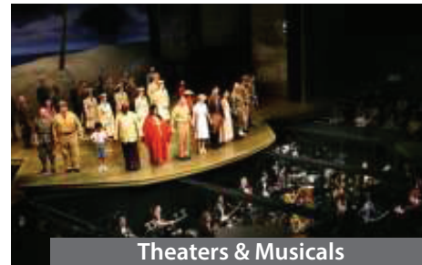
Theaters & Musicals