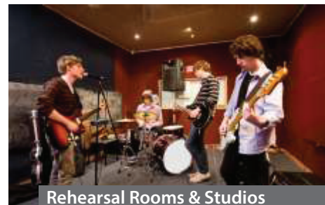
Rehearsal Rooms & Studios

myMix CONTROL, the web browser based software, completes the system by offering the engineer the capability to back up a whole system, configure and edit individual units, or lock specific functions through any device that accesses the network wired or wireless.